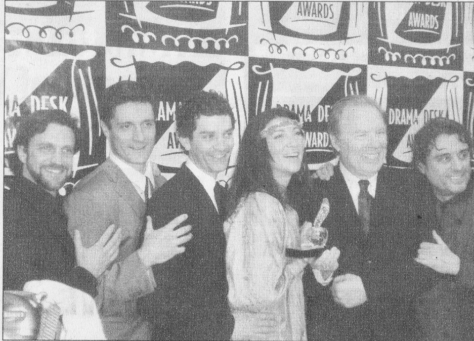
The cast of The Homecoming took the Outstanding Ensemble Award at this year's Drama Desk Awards.

It was a draw for the rest of the categories, as the comic drama August: Osage County , the Patti LuPone headed Gypsy , and the daring new musical Passing Strange each grabbed three awards throughout the night. Laura Benanti, who brings life and heart to the role of Louise in Gypsy , gave the most touching speech of the evening as she broke into