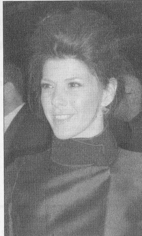
Marisa Tomei was on hand at the awards as a presenter, and was also nominated for her role in Top Girls .

In what was perhaps the most interesting award of the evening, Outstanding Actor nominee Bill Pullman presented a Drama Desk Special Award to Edward Albee, the famous playwright behind