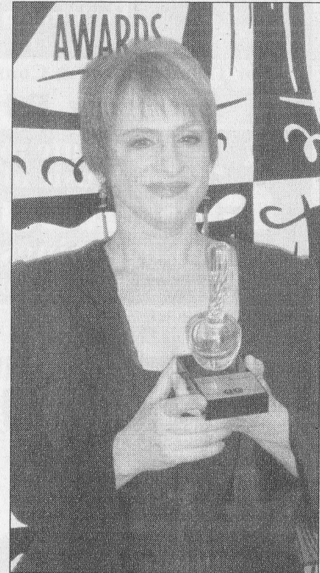
Star of Gypsy , and local gal Patti LuPone grabbed three awards throughout the night.