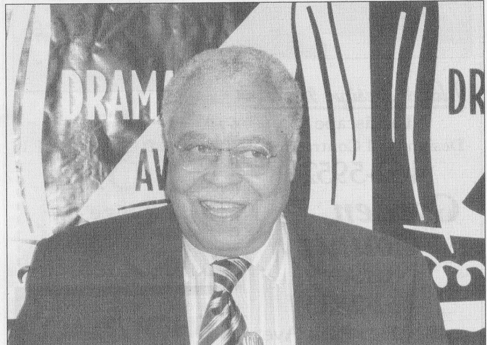
Accepting the Drama Desk Special Award was James Earl Jones for his work in Cat on a Hot Tin Roof .

The Drama Desk Awards often help to foreshadow who will be taking the stage at Radio City Music Hall when the Tony Awards commence. Based on the biggest awards of the night, Outstanding Play, Musical, Revival of a Play, and Revival of a Musical, it will be very difficult to obtain tickets to August: Osage County , Passing Strange , Boeing, Boeing , and South Pacific , the respective winners, come June 15.